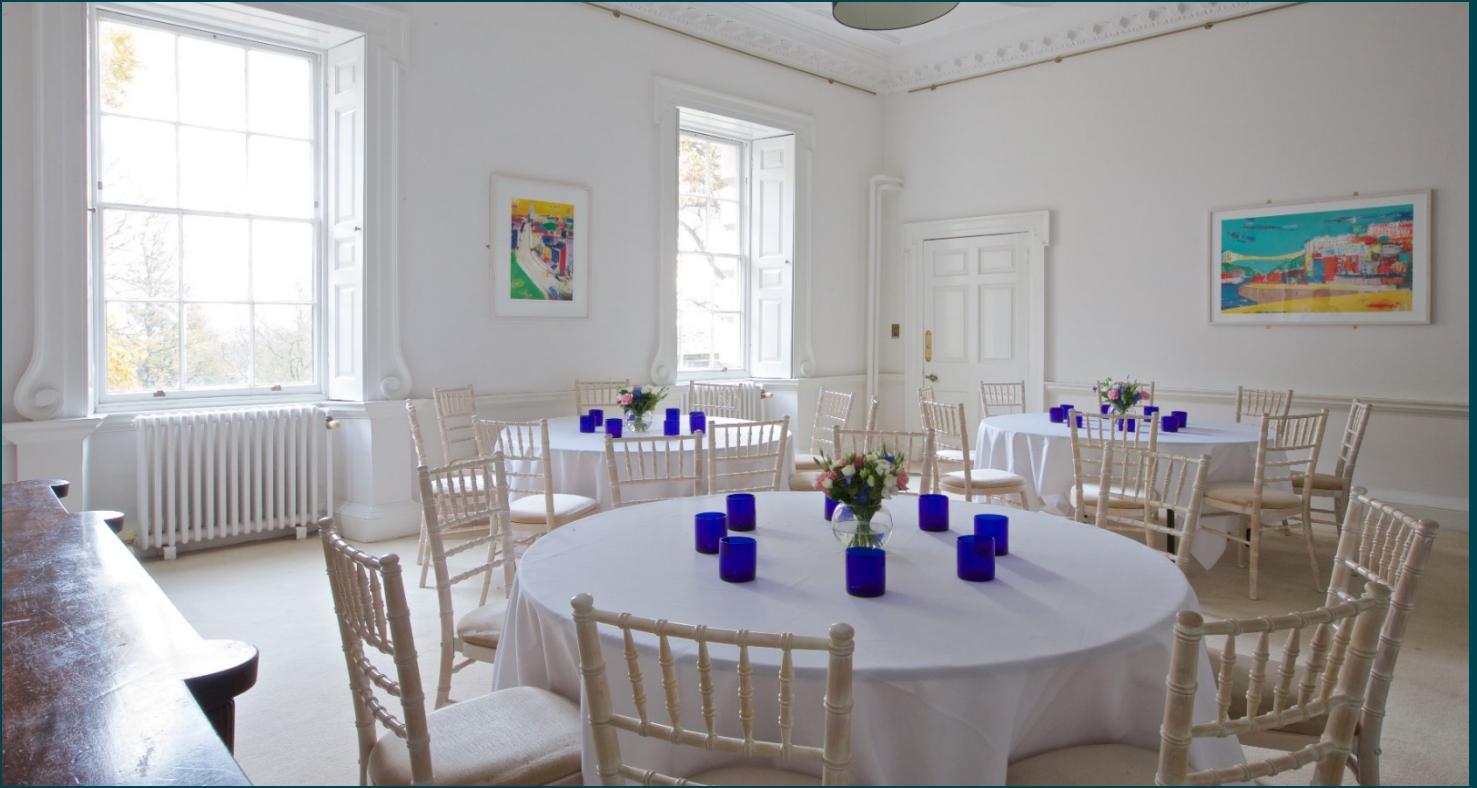
The Clifton Lounge