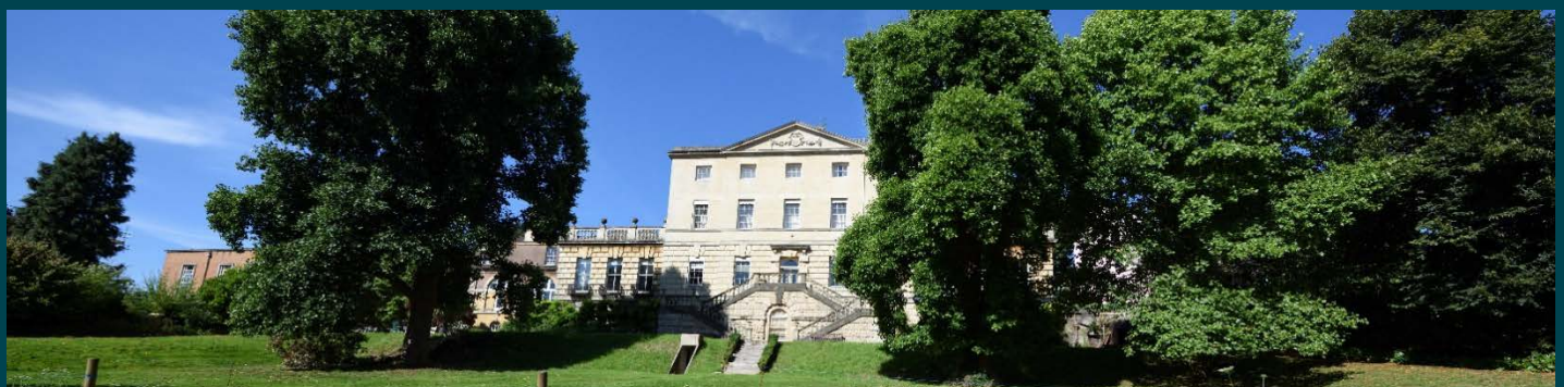
View of the House