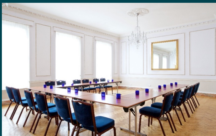
The Reception Room