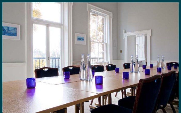
The Clifton Room